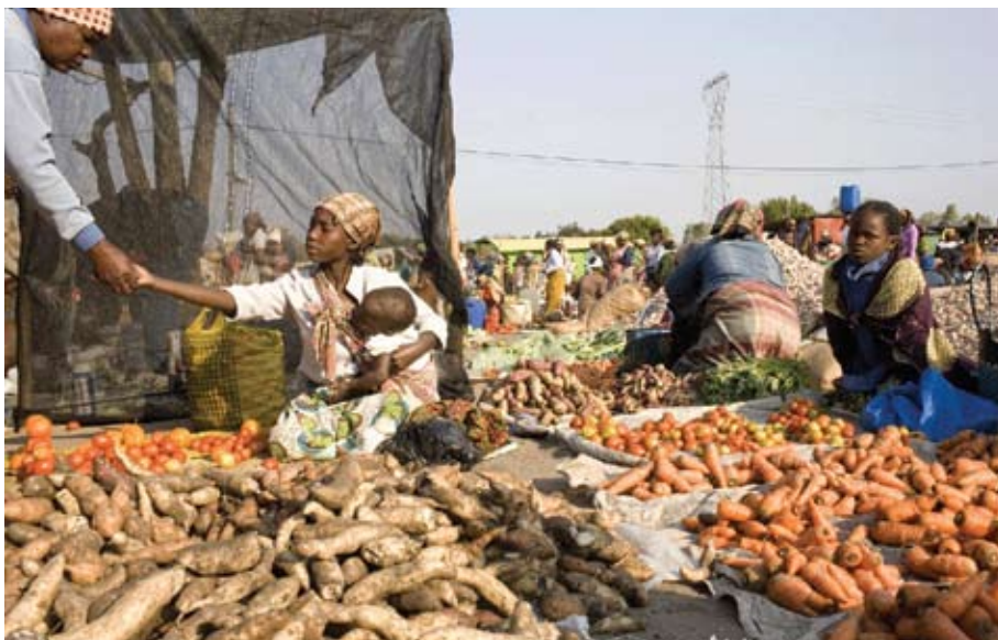
Cassava being sold at a market in Mozambique.

a major advantage for African farming regions that have limited water resources. Also, cassava is farmed at a low intensity, meaning that regions that have been plagued by AIDS and other diseases are more likely to expend the physical energy necessary to plant and harvest the crop. Finally,